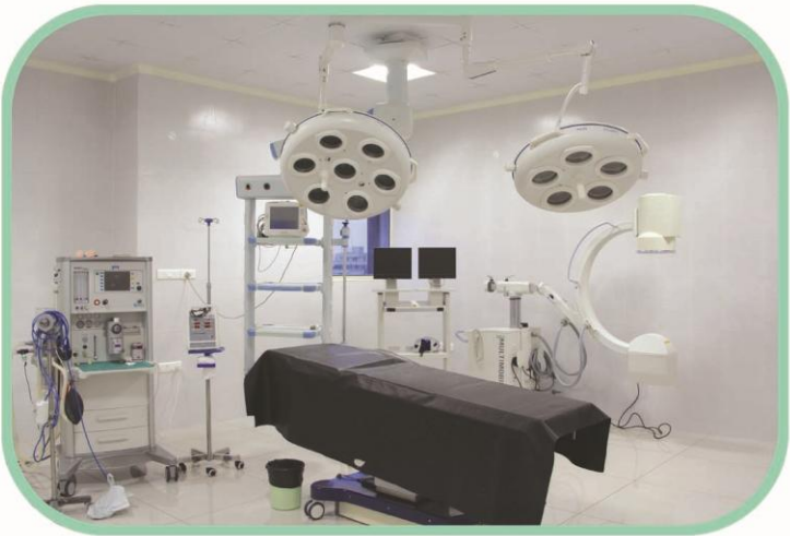
Fully equipped Modern Operation Theater