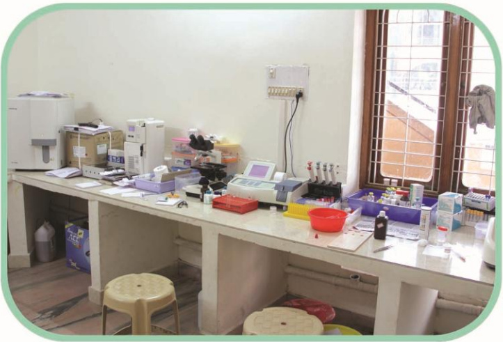
Advanced in-house Laboratory

To anticipate and exceed the expectations of our patients/ care seekers through professional experience, ethical behavior and team work by way of prompt, efficient response in a friendly environments through continuous improvement in clinical pathways.