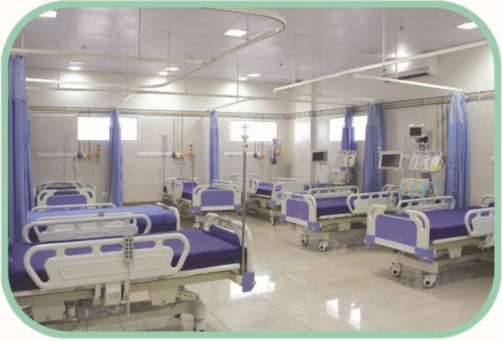
Well equipped ICU with Central Oxygen / Ventilator with well trained nursing staff and advanced monitoring systems.